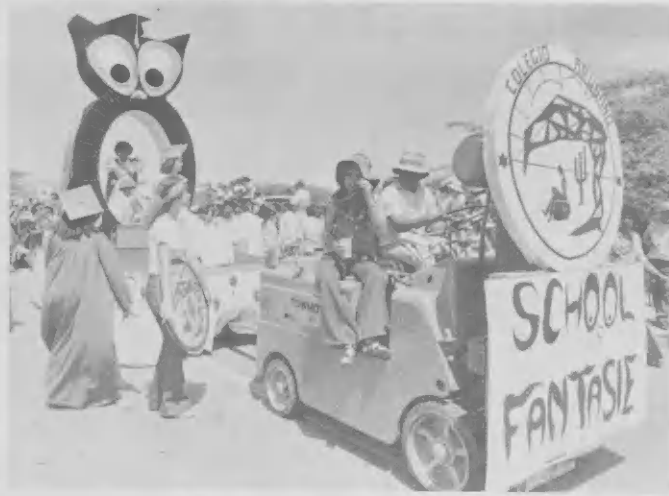
Colegio Arubano School Fantasy